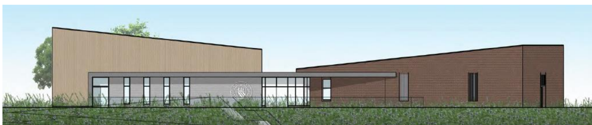
Proposed south elevation facing River Mersey

The scheme is broken into three forms; two mono-pitch wings and a centrally positioned glazed lobby and cafe. The community hall is the tallest element of the scheme, justified by its use as a badminton court, the size of which is based on guidance from Sport England. The tallest element of the building would be 8.4 metres at its highest point of the community hall element dropping to 3.7 metres at the central entrance. The changing room element of the building ranges in height from 6.6 metres dropping to 4.8 metres. The building would accommodate 4 changing rooms, officials changing, kitchen café, meeting room and community hall. The proposed materials for the building are a brown brick, with centrally glazed elements and a profiled metal cladding.