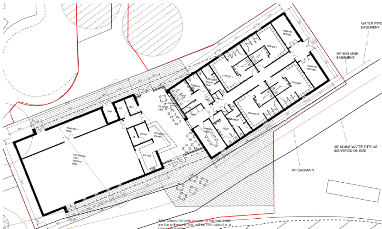
Proposed ground floor plan

The scheme is broken into three forms; two mono-pitch wings and a centrally positioned glazed lobby and cafe. The community hall is the tallest element of the scheme, justified by its use as a badminton court, the size of which is based on guidance from Sport England. The tallest element of the building would be 8.4 metres at its highest point of the community hall element dropping to 3.7 metres at the central entrance. The changing room element of the building ranges in height from 6.6 metres dropping to 4.8 metres. The building would accommodate 4 changing rooms, officials changing, kitchen café, meeting room and community hall. The proposed materials for the building are a brown brick, with centrally glazed elements and a profiled metal cladding.