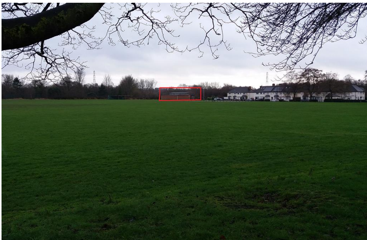
View south west across the playing fields from Southdene Avenue