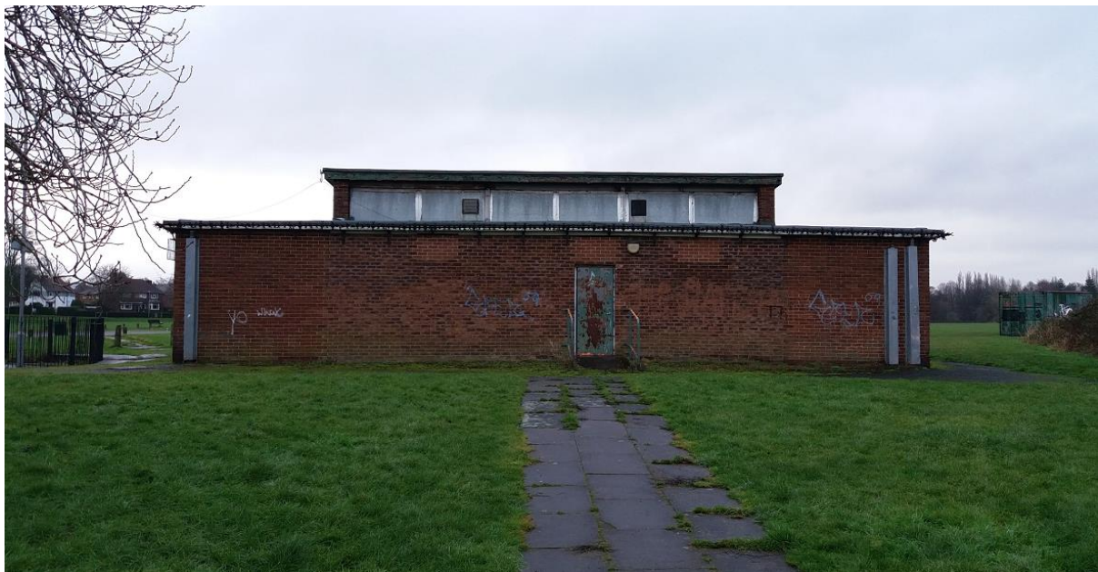
The existing changing room building – The head of Waterford Avenue is located to the left and River Mersey to the right off the picture