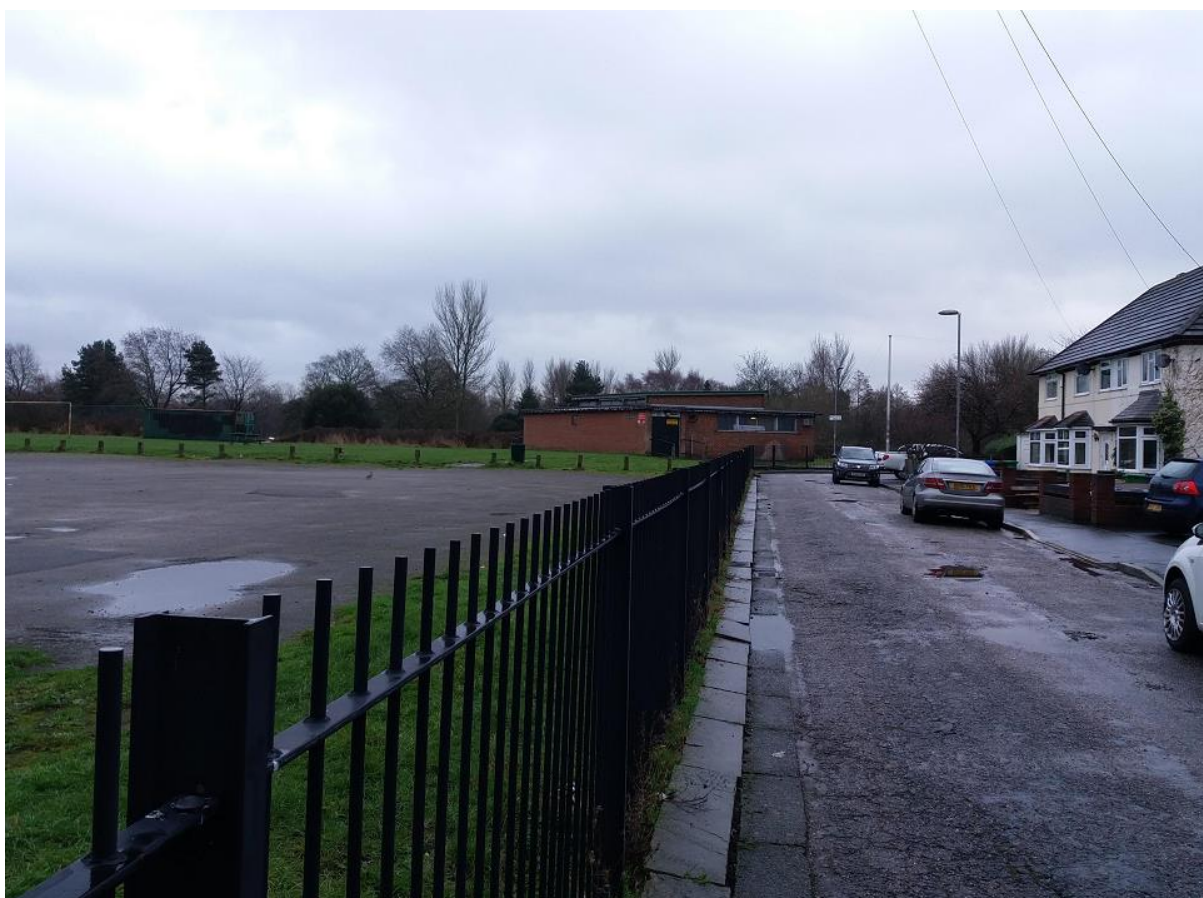
View south down Waterford Avenue towards the existing building