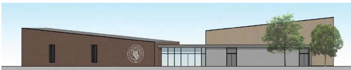
Proposed north elevation facing towards Waterford Avenue