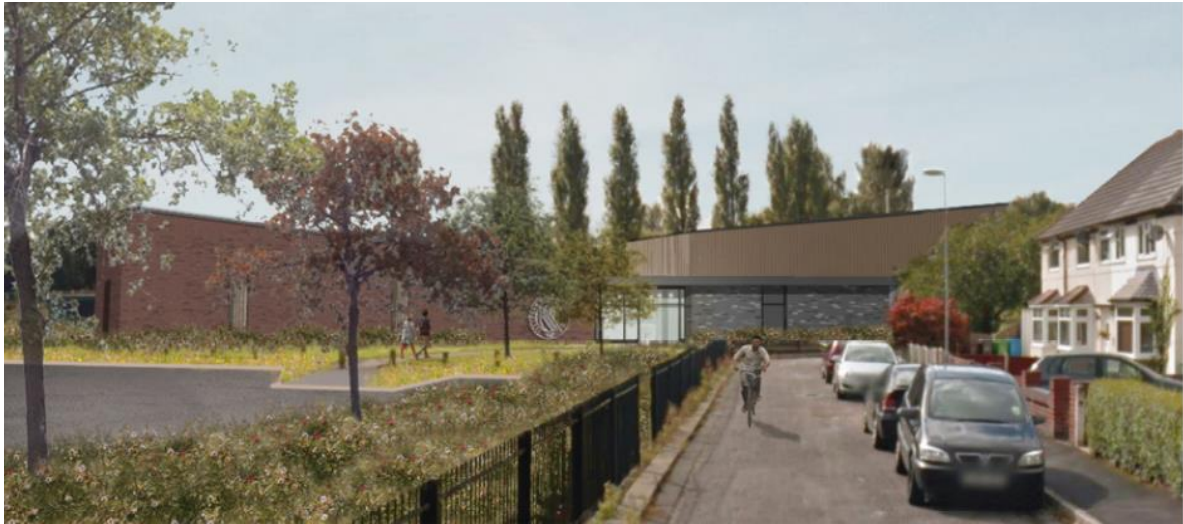
CGI View looking south down Waterford Avenue towards the proposed building

Conflict with the purposes of the Green Belt – The five purposes of the Green Belt are long established and are: